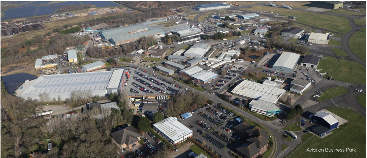
Aviation Business Park