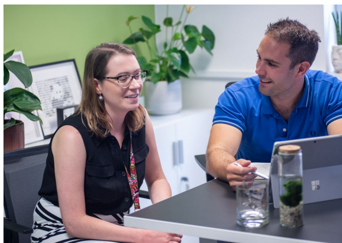
Colleagues at PKF Francis Clark's Poole office