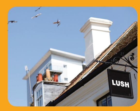
Click on the image above to watch videos about careers in retail and customer services